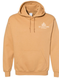
Hoodie (No Zipper)