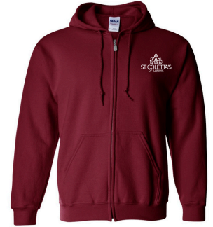
Full Zipper Hoodie