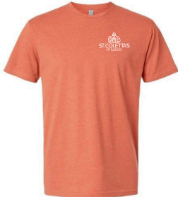
Short Sleeve T-Shirt