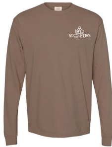
Long Sleeve T-Shirt